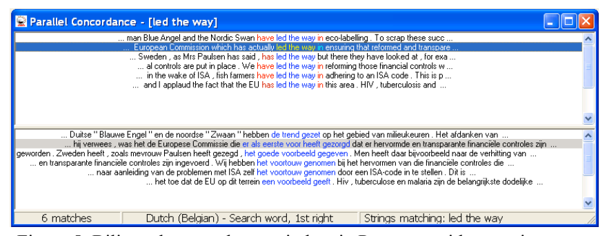
Figure 5: Bilingual concordance window in Paraconc with a contiguous search query

Figure 5 presents an example of a concordance search for the expression "led the way" in a bilingual corpus. The parallel corpus search offers several Dutch translation suggestions: de trend zetten , als eerste voor iets zorgen , het (goede) voorbeeld geven, het voortouw nemen , etc.